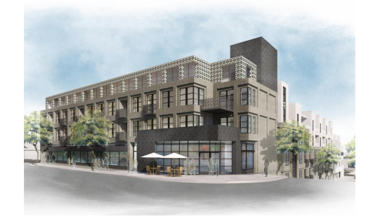
4100 Sunset Boulevard and 4311 Sunset Boulevard