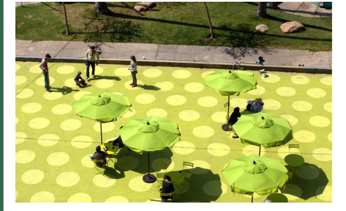
The Sunset Triangle Plaza in sunnier times.